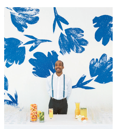
One New York couple designed a custom

How do we love Vahine? Let us count the ways: First, its 23 almost-empty acres are filled with coconut groves for walking and beaches for frolicking. Second, from wherever you sunbathe, you'll overlook a turquoise lagoon-but the more ambitious can play badminton, learn to weave palm leaves, or windsurf, all included in your waterside abode's rate. Finally, if you're up for exploring, sail to the nearby isle of Taha'a to visit a vanilla plantation or a pearl farm, where you'll pick up the Tahitian black variety (from $395 a night, vahine-island.com).